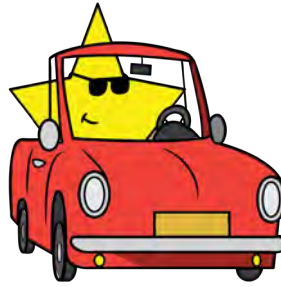
Star in a Car /st/ as in stick , cast