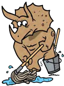
Triceratops with his Buckets and Mops /tr/ as in trick