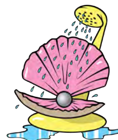
Oyster Feeling Moister /ɔɪ/ as in join, boy