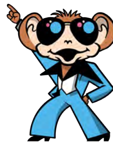
Monkey Feeling Funky /m/ as in more, am