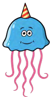
Jellyfish that Made a Wish /dʒ/ as in gem, juice