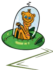
Zuto from Pluto /z/ as in was , zip