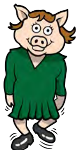
Pig in a Wig /p/ as in pick