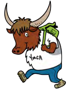
Yak with a Pack /j/ as in your