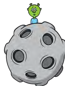
Oon on the Moon /u:/ as in food