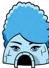
Igloo with a Blue Hairdo /ɪ/ as in lit, in