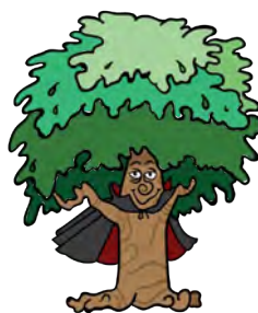
Oak in a Cloak /oʊ/ as in road, code