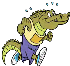
Crocodile who Ran a Mile /kr/ as in cry