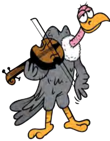
Vulture into Culture /ʌ/ as in love , of