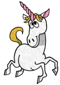
Unicorn with a Pink Horn /ju:/ as in cute