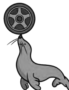
Seal with a Wheel /s/ as in so, pass