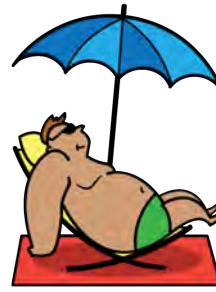
Umbrella Man with a Suntan /ʌ/ as in bun , love