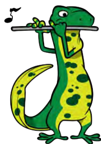
Newt with a Flute /n/ as in run, know