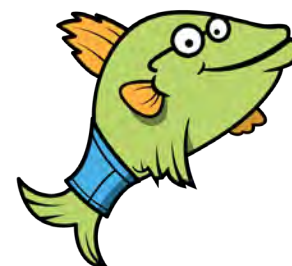
Fish that Goes Splish /f/ as in off, phone