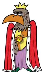
Eagle Feeling Regal /i:/ as in sweet, these