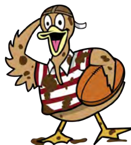
Duck Covered in Muck /d/ as in dip, hid