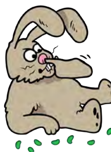
Rabbit with a Bad Habit /r/ as in rock, very