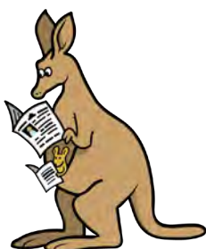
Kangaroos Reading the News /k/ as in cave, lock