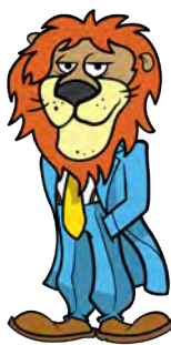
Lion with a Tie On /l/ as in lift, smile