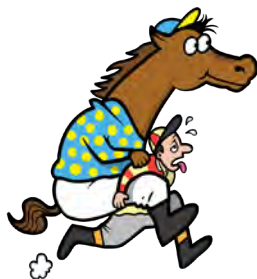
Horse on the Course /h/ as in have, her