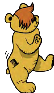
Bear with Long Hair /b/ as in bad, rib