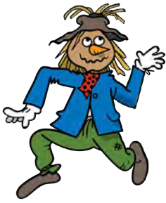
Scarecrow who Let his Hair Grow /sk/ as in skip , score