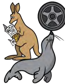
Kangaroos-Seal /ks/ as in wax , box