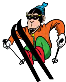
Chimpanzee Learning to Ski /tʃ/ as in chip, watch