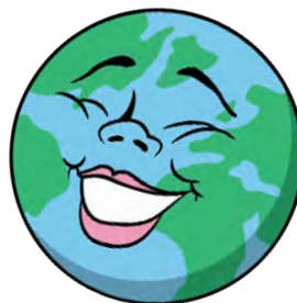
Earth Full of Mirth /ɜ:/ as in hurt, work