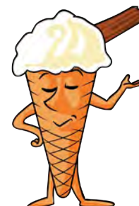
Ice Cream Feeling Supreme /aɪ/ as in my, like