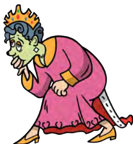
Queen Feeling Green /kw/ as in quick