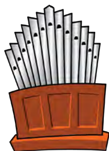
Organ Played by a Gorgon /ɔ:/ or /ɔ:r/ as in corn