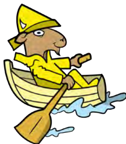
Goat in a Boat /g/ as in great, again