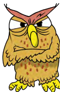
Owl with a Scowl /aʊ/ as in down, out