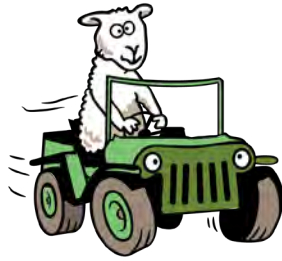
Sheep in a Jeep /j/ - as in shop