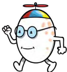
Egg with Little Legs /e/ as in peg