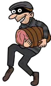
Thief who Stole the Beef /θ/ as in thing , and /ð/ as in them