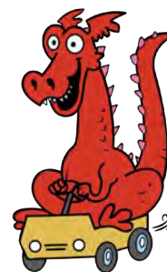
Dragon in a Wagon /dr/ as in drip