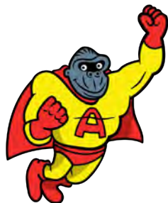
Ape in a Cape /eɪ/ as in made, rain