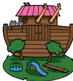
Ark in the Park /ɑ:/ or /ɔr/ as in harp