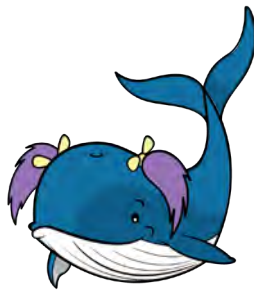
Whale with Purple Pigtails /w/ as in win , what