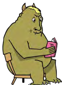
Ook Reading a Book /ʊ/ as in look, put